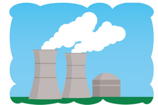
(2) power plant

make 2 drawings that would connect (1) with (2) i.e. how does one lead to the other