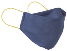
(1) polypropylene cloth mask

illustrate your idea + label your drawings